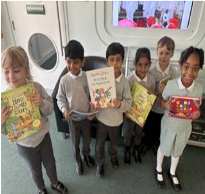
Children from Kingfisher Class