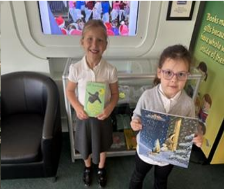
Children from Jaguar Class