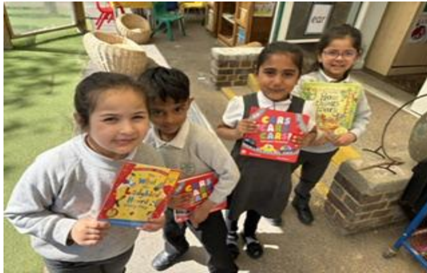
Children from Robin Class

HUGE CONGRATULATIONS TO ALL OF THEM - KEEP READING EVERYBODY!!