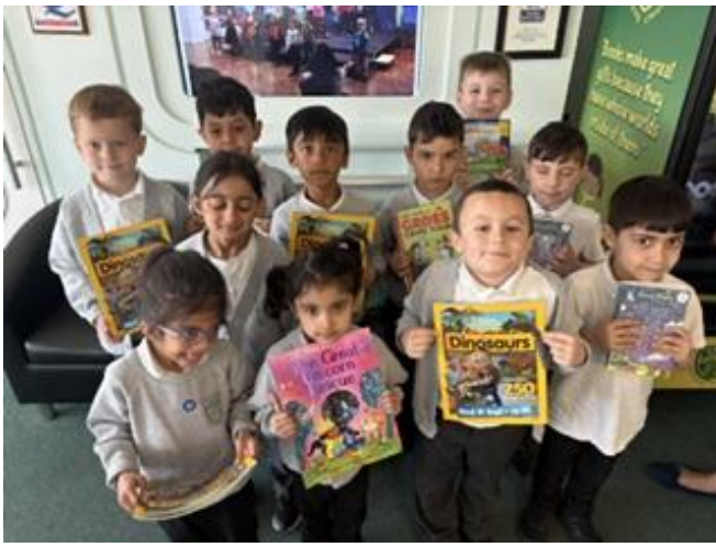
Children from Starfish Class