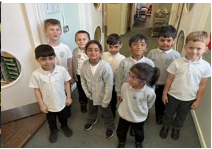
Children from Dolphin Class