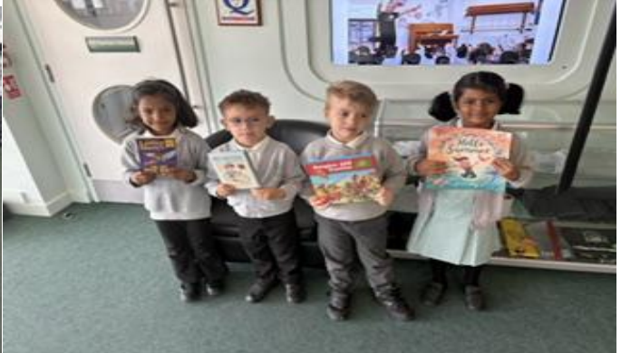
Amazing readers from Starfish class