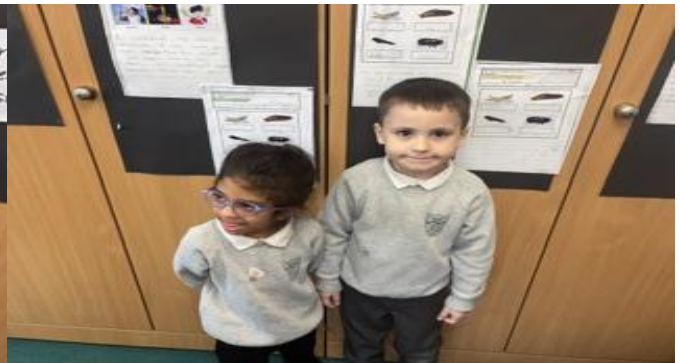
Wonderful writers from Dolphin class