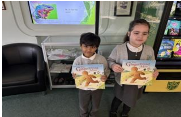
More amazing readers from Sea Turtle class

HUGE CONGRATULATIONS TO ALL OF THEM - KEEP READING EVERYBODY!!