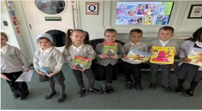
More amazing readers from Dolphin class