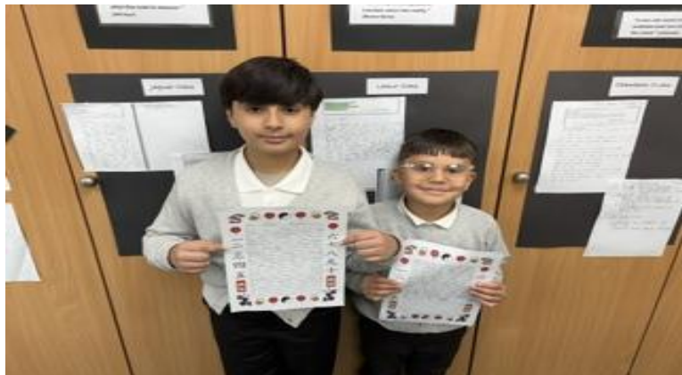
More wonderful writers from Lemur class.