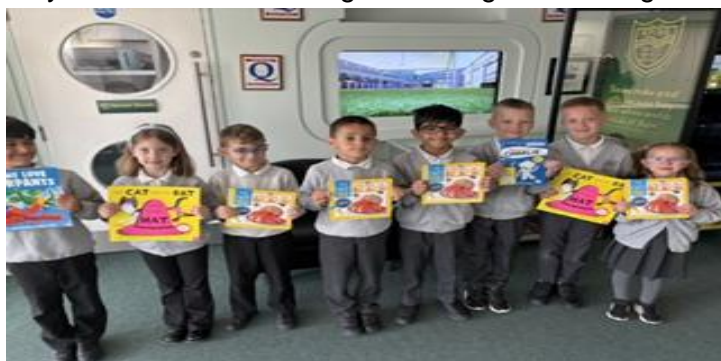
Amazing readers from Chameleon class

I am really proud to announce the names of the children who have received books from the vending machine because they have received their 6 gold reading stars during the last two weeks. Well done to all of the following children: