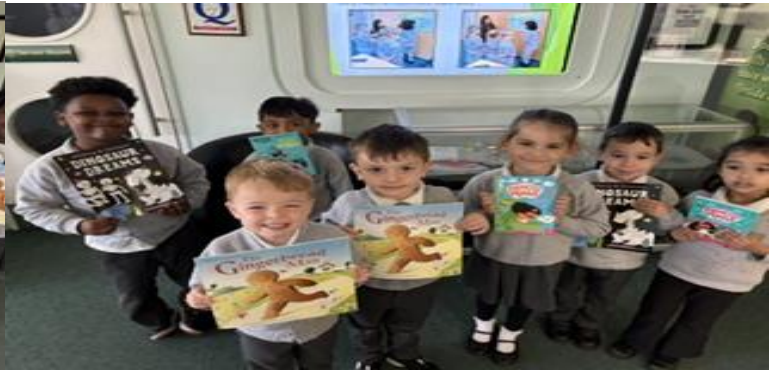
More amazing readers from Robin class