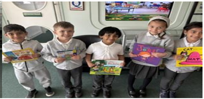
Amazing readers from Lemur class