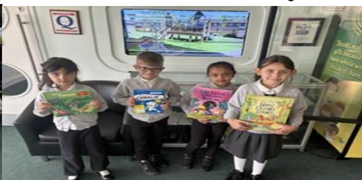
Amazing readers from Jaguar class