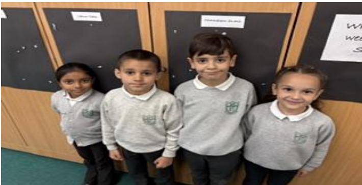
Wonderful writers from Chameleon class

Each week two children are chosen by their teachers to have their writing displayed in the Head Teacher's office. Here you can see how proud the children are of their amazing literary works: