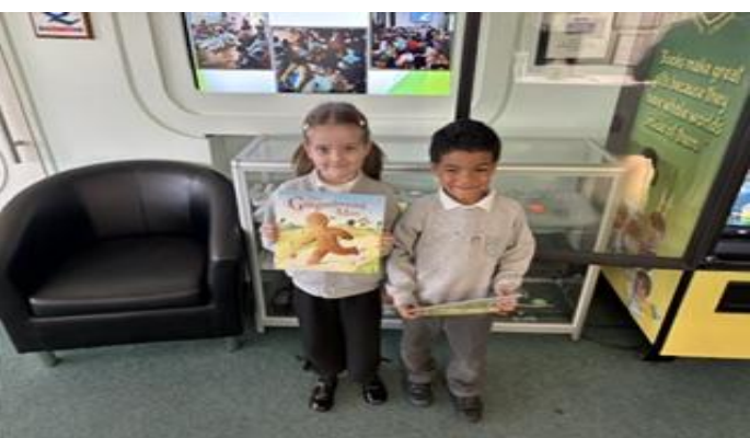
More amazing readers from Kingfisher class