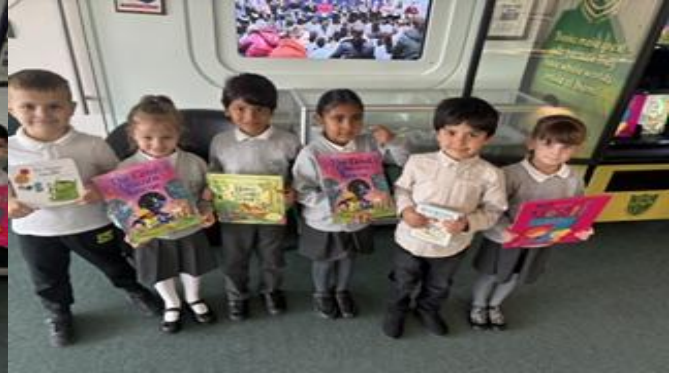
Amazing readers from Robin class