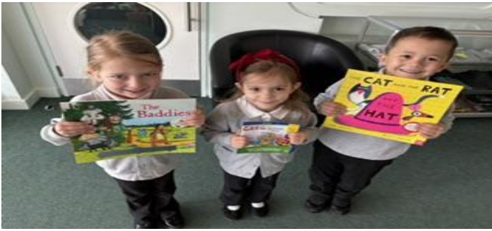
Amazing readers from Kingfisher class