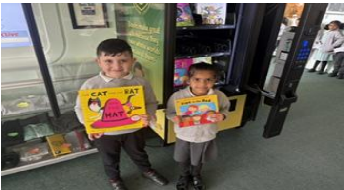
Amazing readers from Sea Turtle class