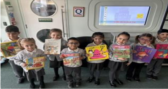
Amazing readers from Owl class