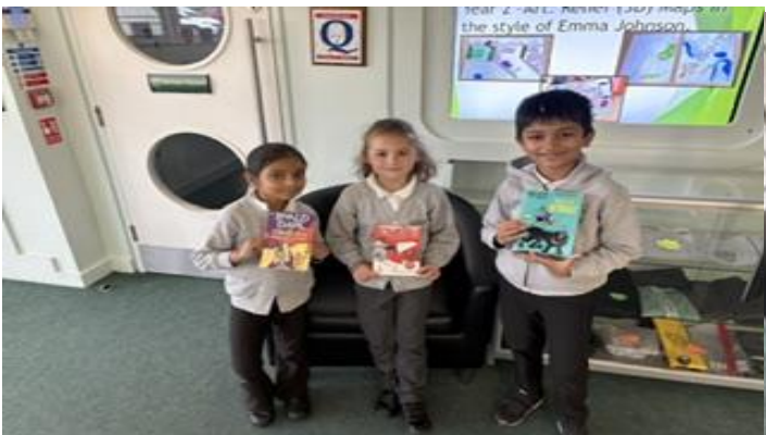
More amazing readers from Chameleon class